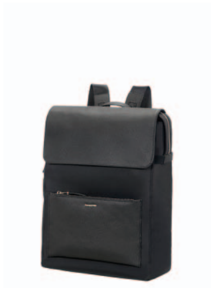
74558 (85D*006): RECTANGULAR BACKPACK 14.1":