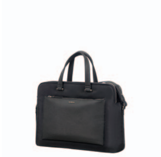
74555 (85D*004): ORGANIZED BAILHANDLE 14.1":