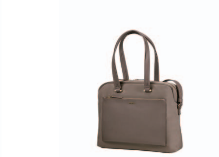
74556 (85D*003): BAILHANDLE 14.1":