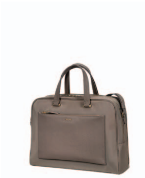
74557 (85D*005): BAILHANDLE 15.6":