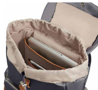
Smart Sleeve to stack your bag on your suitcase