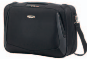
75115 (04N*013): BI-FOLD GARMENT BAG*: 55 X 40 X 20 - 47.5 L - 1.8 KG *** 25,5 x 17 x 0,9