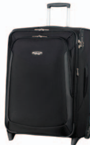
75099 (04N*004): UPRIGHT 69 EXP*: 46 X 69 X 31/35 - 91/99 L - 3.2 KG *** 17 x 25,5 x 0,9