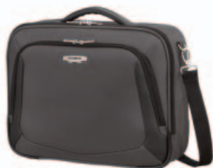
75125 (04N*016): LAPTOP SHOULDER BAG: 45 X 38 X 15 - 24.5 L - 0.9 KG