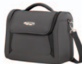
75126 (04N*017): BEAUTY CASE: 33 X 30 X 19 - 16.5 L - 0.5 KG