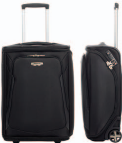
75121 (04N*014): GARMENT BAG/WH CABIN*: 40 X 55 X 20 - 37.0 L - 2.5 KG *** 17 x 25,5 x 0,9