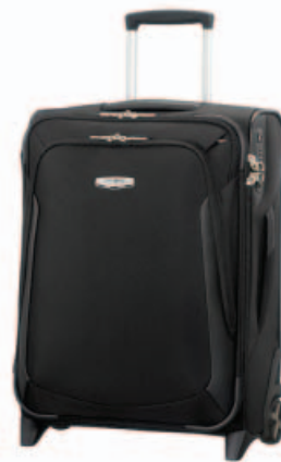
75096 (04N*002): UPRIGHT 55 STRICT: 40 X 55 X 20 - 44.0 L - 2.5 KG *** 17 x 25,5 x 0,9