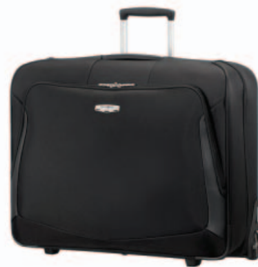
75123 (04N*015): GARMENT BAG/WH LARGE*: 60 X 51 X 26 - 69.5 L - 3.4 KG *** 17 x 25,5 x 0,9