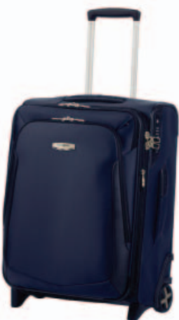
75098 (04N*003): UPRIGHT 55 EXP: 40 X 55 X 23/27 - 46/51.5 L - 2.6 KG *** 17 x 25,5 x 0,9