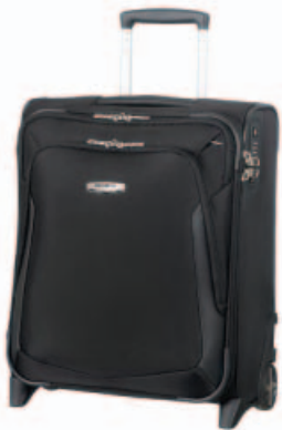
75093 (04N*001): UPRIGHT 50*: 40 X 50 X 20 - 39.0 L - 2.4 KG *** 17 x 25,5 x 0,9