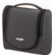
75127 (04N*018): TOILET KIT: 25 X 24 X 10 - 6.0 L - 0.3 KG