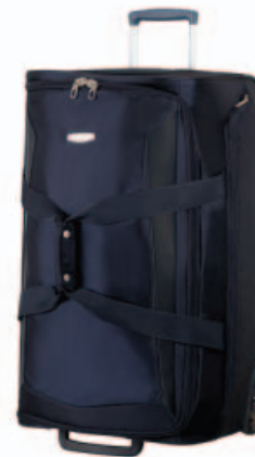
75110 (04N*010): DUFFLE/WH 73: 44 X 73 X 37 - 106.0 L - 3.5 KG