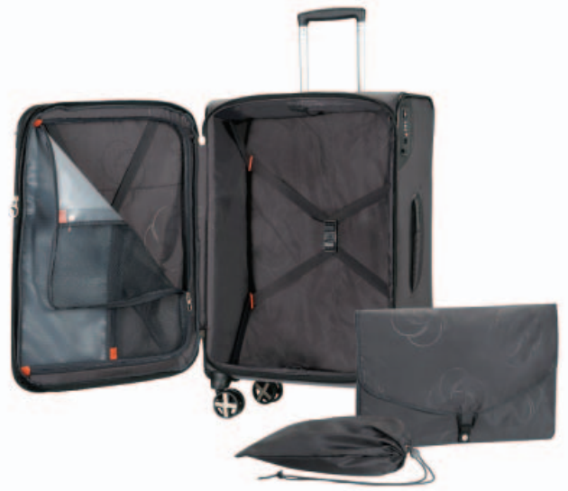
75102 (04N*007): SPINNER 63 EXP: 41,5 X 63 X 27/31 - 63/69 L - 2.9 KG *** 17 x 25,5 x 0,9