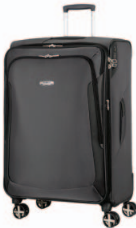
75109 (04N*009): SPINNER 78 EXP: 48 X 78 X 32/37 - 112.5/121 L - 4.0 KG *** 17 x 25,5 x 0,9