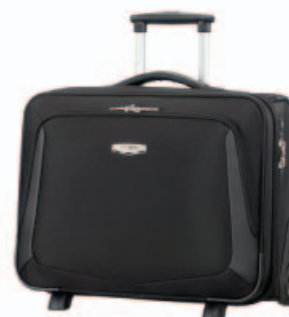
75128 (04N*019): ROLLING TOTE 17.3"*: 48 X 40 X 22 - 32.0 L - 3.0 KG