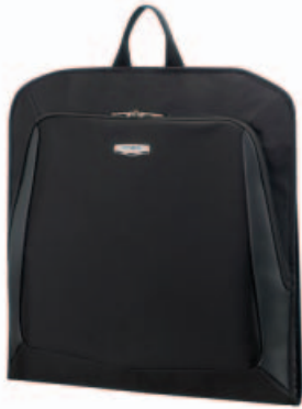
75113 (04N*012): GARMENT SLEEVE*: 53 X 53 X 5 - 0.8 KG