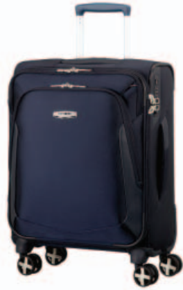
75101 (04N*006): SPINNER 55 STRICT: 40 X 55 X 20 - 38.5 L - 2.6 KG *** 17 x 25,5 x 0,9