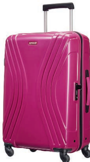
62861 (91A*002): SPINNER 70 48 x 70 x 28 || 75.0 L - 3.7 KG