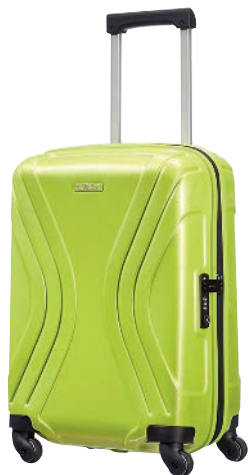
62860 (91A*001): SPINNER 55 38 x 55 x 22 || 36.0 L - 2.5 KG