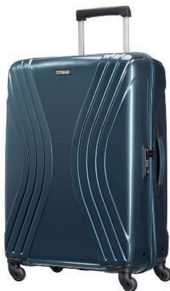
62862 (91A*003): SPINNER 75 53 x 75 x 29 || 90.0 L - 4.1 KG