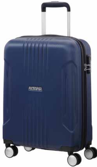
88742 (34G*001): SPINNER 55 40 x 55 x 20 || 34.0 L - 2.6 KG