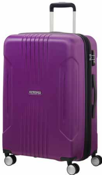
88745 (34G*002): SPINNER 67 EXP 44,5 x 67 x 27/31 || 71/82 L - 3.8 KG