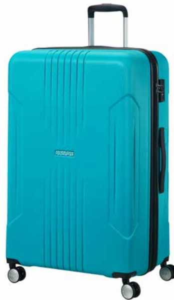
88752 (34G*003): SPINNER 78 EXP 50 x 78 x 30/34 || 105/120 L - 4.4 KG