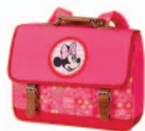
72641 (28C*004): SCHOOLBAG S: 34,5 X 27 X 10,5 - 8.0 L - 0.5 KG