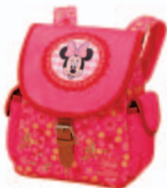
72638 (28C*001): BACKPACK S: 26 X 27,5 X 14 - 6.5 L - 0.4 KG