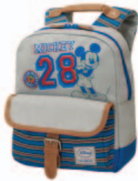
72638 (28C*001): BACKPACK S: 22 X 28 X 14 - 7.5 L - 0.3 KG