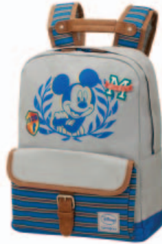
72639 (28C*002): BACKPACK S+ PRE-S: 28,5 X 32 X 16 - 11 L - 0.5 KG