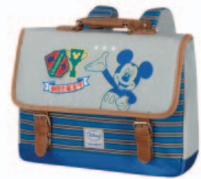
72641 (28C*004): SCHOOLBAG S: 34,5 X 27 X 10,5 - 8.0 L - 0.5 KG