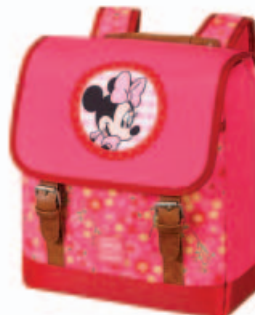
72639 (28C*002): BACKPACK S+ PRE-S: 28,5 X 32 X 16 - 11 L - 0.5 KG