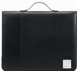
111009 (CL4*003): ZIP FOLDER A4 TOP H + DET B: 27 X 34,5 X 5 - 4.7 L - 1.3 KG *** 26,6 x 18,3 x 1,5 📁 📅 🖋️ 📏 26,7 cm/10.5"