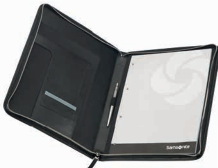
111007 (CL4*001): ZIP FOLDER A4: 33 X 45 X 2,5 - 3.7 L - 0.7 KG 📁 📅 🖋️