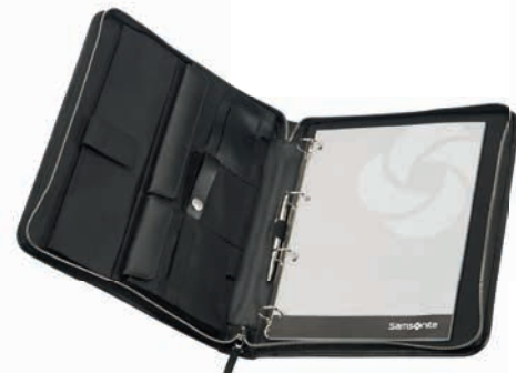
111008 (CL4*002): ZIP FOLDER A4 + DET B: 27 X 34,5 X 5 - 4.7 L - 1.3 KG *** 26,6 x 18,3 x 1,5 📁 📅 🖋️ 📏 26,7 cm/10.5"