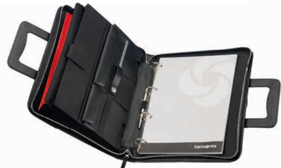
111010 (CL4*004): ZIP FOLDER A4 RET H + DET B: 27 X 34,5 X 5 - 4.7 L - 1.5 KG *** 26,6 x 18,3 x 1,5 📁 📅 🖋️ 📏 26,7 cm/10.5"