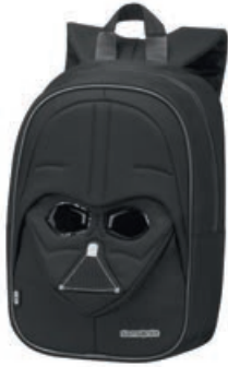
73354 (25C*006): BACKPACK S+ JUNIOR: 22,5 X 33 X 15 - 10.0 L - 0.2 KG