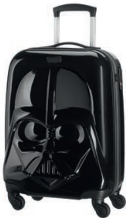
73356 (25C*008): HARD SPINNER 55: 40 X 55 X 25 - 36.0 L - 2.7 KG