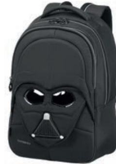
67131 (25C*002): BACKPACK M: 34 X 43 X 17 - 21.5 L - 0.5 KG