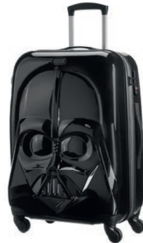
73357 (25C*009): HARD SPINNER 66: 47 X 66 X 29 - 61.5 L - 3.4 KG