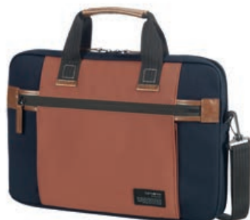
77693 (22N*003): LAPTOP SLEEVE 15.6": 39 X 27 X 11 - 8.9 L - 0.4 KG ** 37,5 x 26 x 3,5 39,6 cm/15.6"