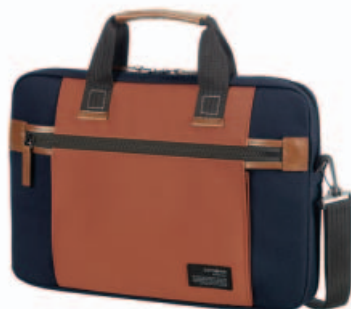
77693 (22N*003): LAPTOP SLEEVE 15.6": 39 X 27 X 11 - 8.9 L - 0.4 KG ** 37,5 x 26 x 3,5 🖥️ 📱 📄 📏 39,6 cm/15.6"