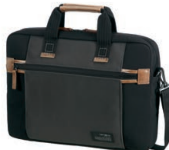
77694 (22N*004): LAPTOP BAG 15.6": 41 X 29 X 13 - 10.5 L - 0.6 KG ** 37,5 x 26 x 3,6 *** 27 x 20 x 1,7 39,6 cm/15.6" 25,7 cm/10.1"