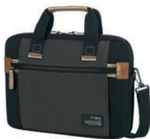
77692 (22N*002): LAPTOP SLEEVE 13.3": 34,5 X 24,5 X 10 - 6.2 L - 0.3 KG ** 33 x 23,5 x 2,7 33,8 cm/13.3"