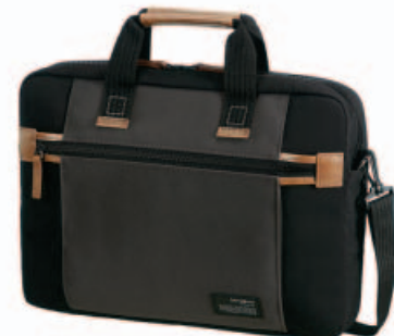
77694 (22N*004): LAPTOP BAG 15.6": 41 X 29 X 13 - 10.5 L - 0.6 KG ** 37,5 x 26 x 3,6 *** 27 x 20 x 1,7 🖥️ 📱 📄 📏 39,6 cm/15.6" 📏 25,7 cm/10.1"

** Maximum laptop size *** Maximum tablet size