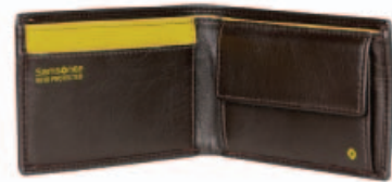
63421 (56V*029): BILLF MINI + 1CC + COIN + C: 10 X 6,8