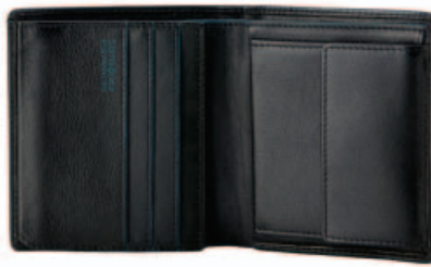
75011 (56V*119): WAL S 5CC + H FL + COIN + 2C: 9,5 X 10,6