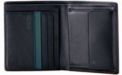
60627 (56V*115): WAL S 4CC + COIN + 2C: 9,8 X 12