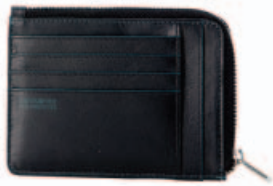
75015 (56V*702): 8CC HOLDER + ZIP COMP: 12,4 X 9