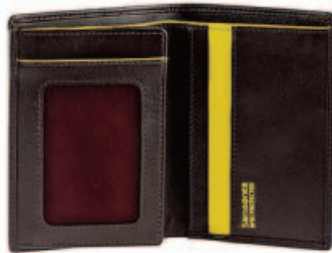
60625 (56V*109): WAL S 4CC + H FL + 2W + 2C: 8,5 X 11,7