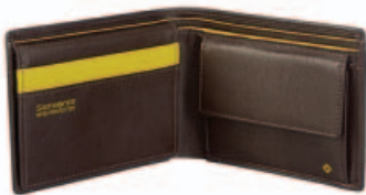
63420 (56V*021): BILLF S 4CC + V FL + COIN + 2C: 10,5 X 8,3