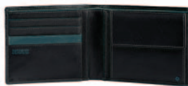
60620 (56V*015): BILLF 4CC + 2COMP + C HOLDER: 10,5 X 8,3