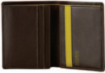
66804 (56V*716): DOUBLE CC HOLDER + ZIP: 8,5 X 10,5