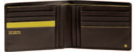
60616 (56V*005): BILLFOLD 8CC + 2COMP: 13 X 9,7