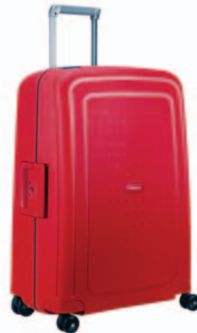
49307 (10U*001): SPINNER 69: 49 X 69 X 29 - 79.0 L - 4.2 KG