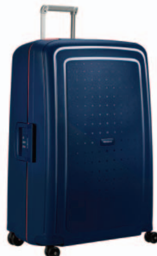
59244 (10U*004): SPINNER 81: 55 X 81 X 35 - 138.0 L - 5.0 KG