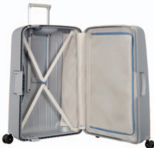
49308 (10U*002): SPINNER 75: 52 X 75 X 31 - 102.0 L - 4.6 KG