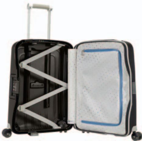
49539 (10U*003): SPINNER 55: 40 X 55 X 20 - 34.0 L - 2.9 KG

MATCHES CABIN COLLECTION p. 45 & BASE BOOST p. 70