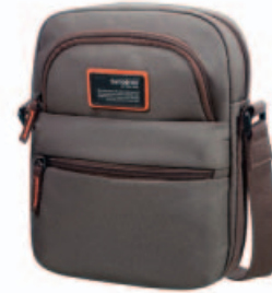
88347 (CA9*002): TABLET CROSSOVER L 9.7": 22 X 27 X 10 - 4.0 L - 0.3 KG *** 17 x 24 x 1,5 24,5 cm/9.7"