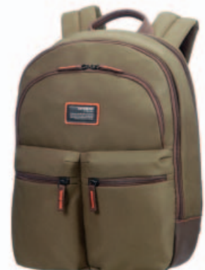
88350 (CA9*005): LAPTOP BACKPACK 15.6": 33,5 X 43 X 23,5 - 18.5 L - 0.8 KG