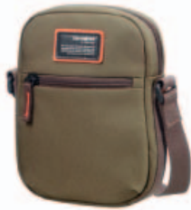
88351 (CA9*001): TABLET CROSSOVER S: 18 X 21,5 X 8 - 2.0 L - 0.2 KG