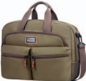
88348 (CA9*003): LAPTOP BAILHANDLE 15.6": 42,5 X 31,5 X 21,5 - 18.5 L - 0.8 KG