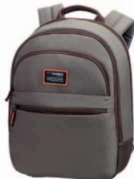
88349 (CA9*004): LAPTOP BACKPACK 14.1": 31 X 40 X 21,5 - 16.0 L - 0.7 KG