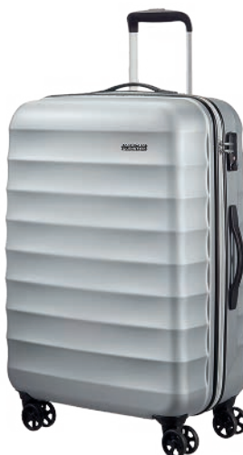
66367 (02G*002): SPINNER 67 46,5 x 67 x 26,5 || 61.0 L - 3.4 KG