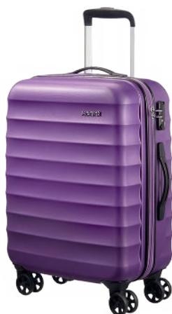
66366 (02G*001): SPINNER 55 40 x 55 x 20 || 32.0 L - 2.4 KG