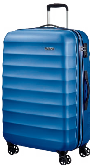
66368 (02G*003): SPINNER 77 52 x 77 x 29 || 88.5 L - 4.1 KG