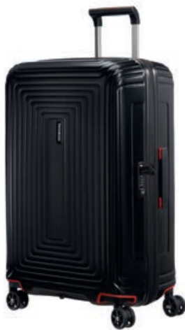
65753 (44D*002): SPINNER 69*: 46 X 69 X 27 - 74.0 L - 3.0 KG