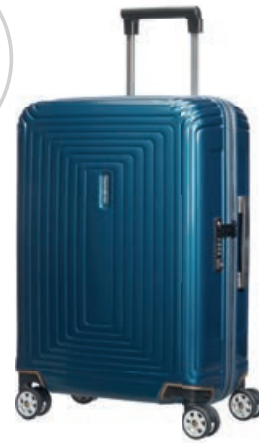
105646 (44D*005): SPINNER 55 WIDTH 23 cm: 40 X 55 X 23 - 44.0 L - 2.3 KG