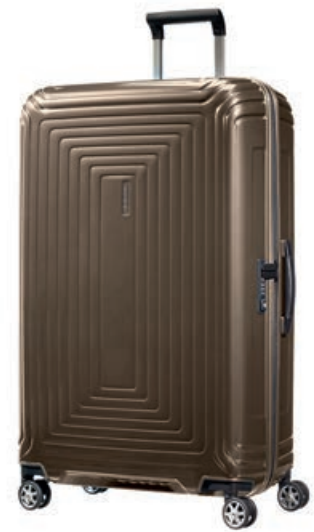
65756 (44D*004): SPINNER 81*: 54 X 81 X 30 - 124.0 L - 3.8 KG