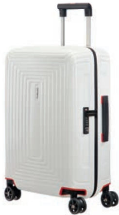
65752 (44D*001): SPINNER 55: 40 X 55 X 20 - 38.0 L - 2.2 KG