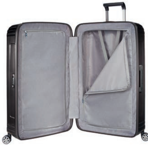
65754 (44D*003): SPINNER 75*: 51 X 75 X 28 - 94.0 L - 3.4 KG