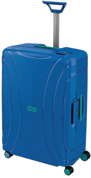
66983 (06G*001): SPINNER 69 x x || . L TSA