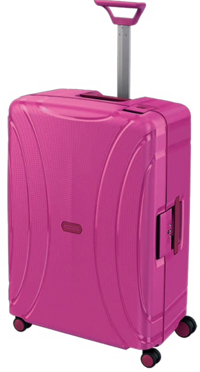
66984 (06G*002): SPINNER 75 x x || . L TSA