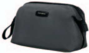
100000 (46N*001): TOILET KIT: 32 X 19 X 15 - 8.0 L - 0.5 KG