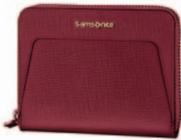
74992 (33D*718): SMALL WALLET: 12 X 8,5 2 6 4