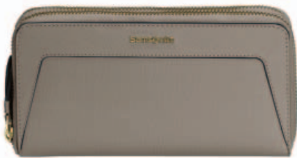
70580 (33D*327): DOUBLE ZIP AROUND L: 18,5 X 10 3 22 7