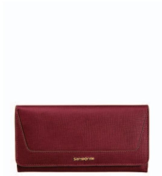
66618 (33D*314): L WAL 14CC + 2W + 2ZIP COIN: 19,4 X 10,4