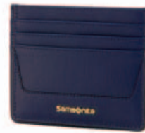
74991 (33D*705): 6CC HOLDER: 10,3 X 8,6 6