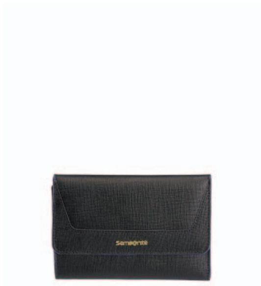
66616 (33D*303): L WALLET 12CC + ZIP EXT M: 15 X 10,5