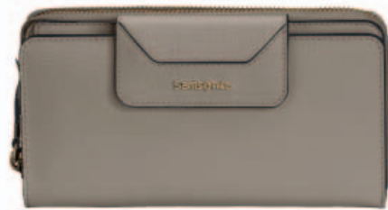
66617 (33D*309): L WAL L 18CC + ZIP EXT: 18,6 X 9,5 18 9