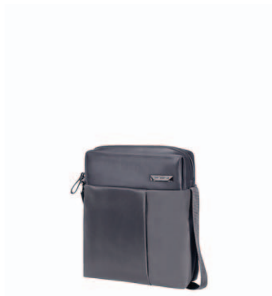
67691 (49D*003): TABLET CROSSOVER 7.9": 21 X 25 X 8,5 - 3.0 L - 0.2 KG *** 13,5 x 20,5 x 1,5 📱 📂 20 cm/7.9"