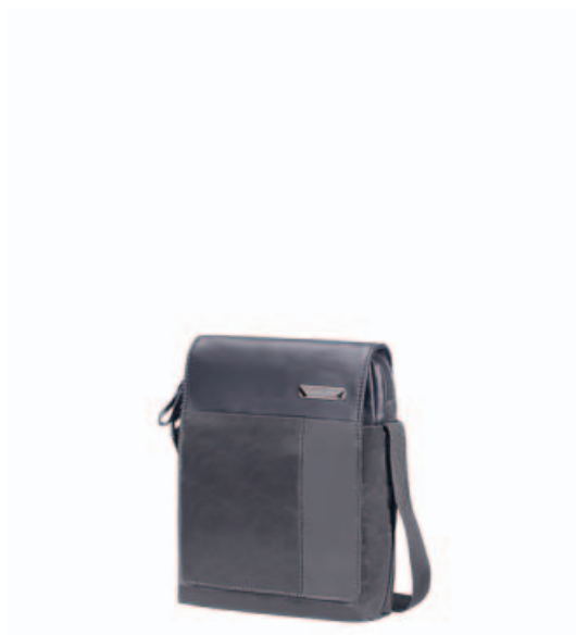
67693 (49D*002): TABL. CROSSOVER 7.9" + FLAP: 19 X 22 X 8 - 2.0 L - 0.3 KG *** 13,5 x 20,5 x 1,5 📱 📂 20 cm/7.9"