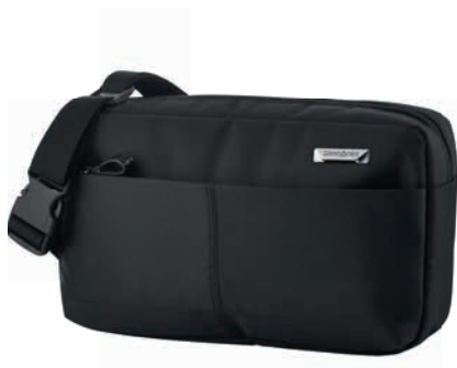
117287 (C09*006): WAIST BAG: 30 X 15,5 X 6 - 4.0 L - 0.3 KG