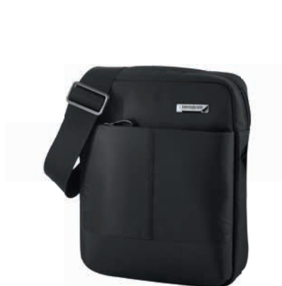
117283 (C09*003): TABLET CR-OVER M 9.7": 19 X 24 X 6 - 3.5 L - 0.3 KG *** 24 x 17 x 1,3 24,5 cm/9.7"