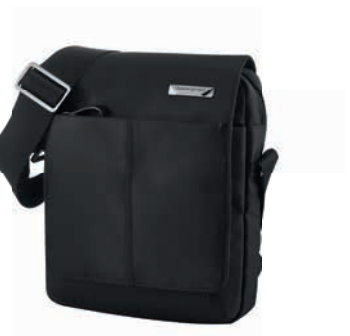
117245 (C09*002): TABLET CR-OVER S 7.9" + FL: 15,5 X 22 X 5 - 2.5 L - 0.3 KG *** 21,6 x 13,5 x 1,4 20,3 cm/8"