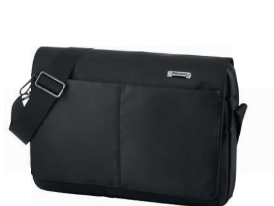
117285 (C09*005): MESSENGER 12.9" + FLAP: 34 X 24 X 6 - 7.0 L - 0.6 KG ** 31 x 21,9 x 2,1 32,8 cm/12.9"