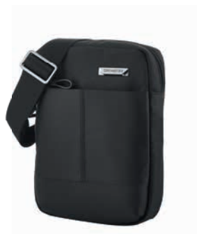
117244 (C09*001): CROSSOVER S 7.9": 15,5 X 22 X 5 - 2.5 L - 0.3 KG *** 21,6 x 13,5 x 1,4 20,3 cm/8"