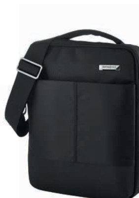
117284 (C09*004): TABLET CR-OVER L 10.5": 21 X 28 X 6 - 5.5 L - 0.3 KG *** 26,6 x 18,3 x 1,5 26,7 cm/10.5"