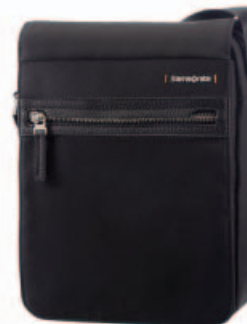
74009 (79D*004): CROSSOVER 9.7" + FLAP: 21 X 26 X 10,5 - 4.5 L - 0.4 KG