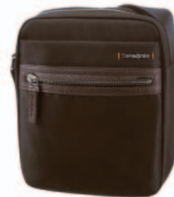
74007 (79D*002): CROSSOVER 7.9": 20 X 23 X 9 - 3.0 L - 0.3 KG