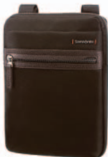
74008 (79D*003): FLAT CROSSOVER 9.7": 20 X 25 X 9 - 3.0 L - 0.3 KG