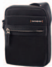
74006 (79D*001): CROSSOVER S: 16 X 20,5 X 7,5 - 2.0 L - 0.3 KG