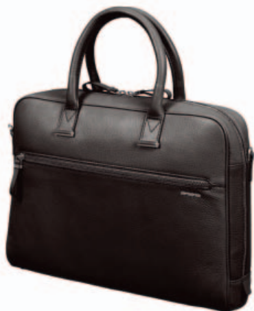
70394 (63D*002): BAILHANDLE 14.1": 41 X 29 X 9,5 - 10.5 L - 1.0 KG ** 34,3 x 24,1 x 3,3 *** 27 x 19 x 1,7 📁 📖 📱 📏 35,8 cm/14.1" 📱 25,7 cm/10.1"