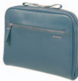
70393 (63D*001): TABLET HOLDER 9.7": 28 X 21 X 26 - 3.5 L - 0.4 KG *** 24 x 17 x 0,8 📱 24,5 cm/9.7"