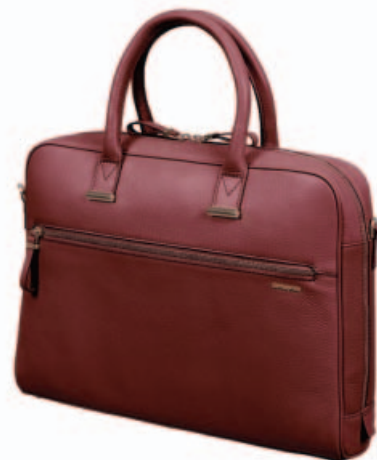
70395 (63D*003): BAILHANDLE 15.6": 42 X 31 X 10,5 - 13.0 L - 1.2 KG ** 37,5 x 26 x 3,5 *** 27 x 19 x 1,7 📁 📖 📱 📏 39,6 cm/15.6" 📱 25,7 cm/10.1"

** Maximum laptop size *** Maximum tablet size