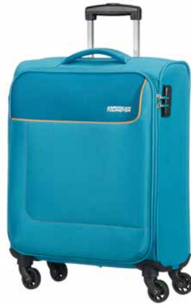
75507 (20G*002): SPINNER 55 40 x 55 x 20 || 36.0 L - 2.5 KG