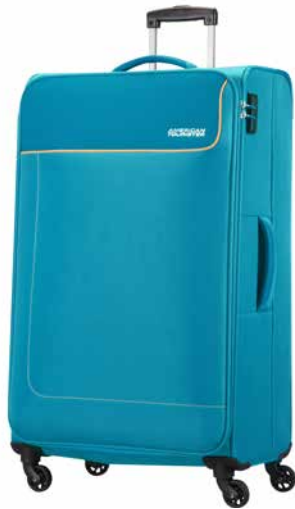
75508 (20G*003): SPINNER 66 43 x 66 x 27 || 63.5 L - 3.3 KG