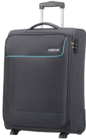
75506 (20G*001): UPRIGHT 55 40 x 55 x 20 || 39.0 L - 2.5 KG