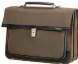
85431 (54N*003): BRIEFCASE 2 GUSSETS 15.6":