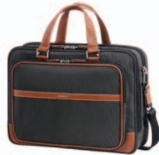
85430 (54N*002): BAILHANDLE 15.6":