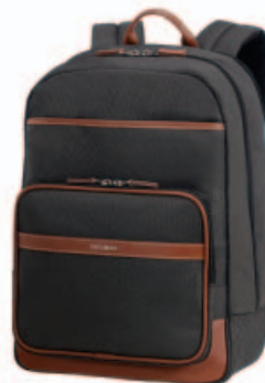
85432 (54N*004): LAPTOP BACKPACK 15.6":