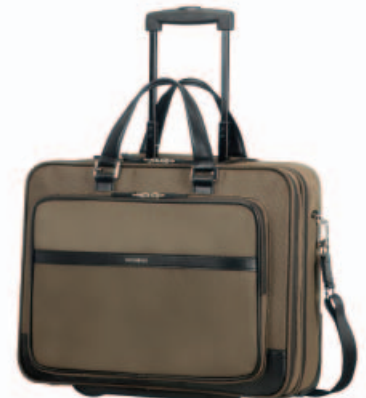
85433 (54N*005): ROLLING TOTE 15.6":