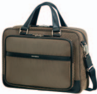
85429 (54N*001): BAILHANDLE 14.1":