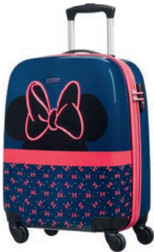
106716 (40C*010): SPIN 55 DISNEY MIN. NEON: 41 X 54,5 X 20,5 - 33.0 L - 2.4 KG