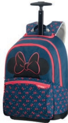
106712 (40C*006): BP/WH DISNEY MINNIE NEON: 34,5 X 48,5 X 19 - 21.5 L - 1.6 KG