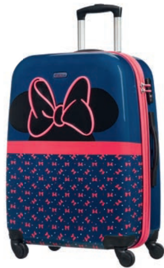
106717 (40C*011): SPIN 65 DISNEY MIN. NEON: 47 X 65 X 25,5 - 55.5 L - 3.3 KG