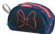
106715 (40C*009): POUCH DISNEY MINNIE NEON: 22,5 X 13,5 X 9,5 - 2.0 L - 0.1 KG