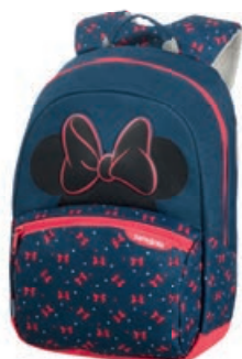
106714 (40C*008): BP S+ DISNEY MINNIE NEON: 23,5 X 35 X 14 - 10.5 L - 0.2 KG