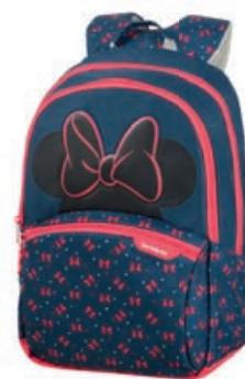
106713 (40C*007): BP M DISNEY MINNIE NEON: 28 X 42 X 17 - 18.5 L - 0.3 KG