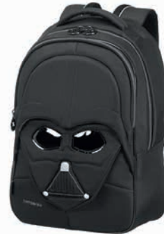
67131 (25C*002): BACKPACK M: 34 X 43 X 17 - 21.5 L - 0.5 KG