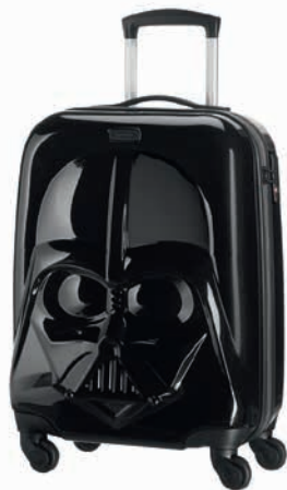
73356 (25C*008): HARD SPINNER 55: 40 X 55 X 25 - 36.0 L - 2.7 KG