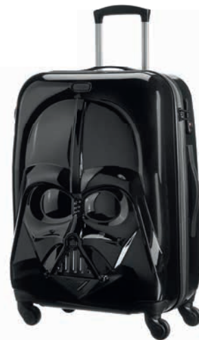
73357 (25C*009): HARD SPINNER 66: 47 X 66 X 29 - 61.5 L - 3.4 KG