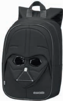
73354 (25C*006): BACKPACK S+ JUNIOR: 22,5 X 33 X 15 - 10.0 L - 0.2 KG