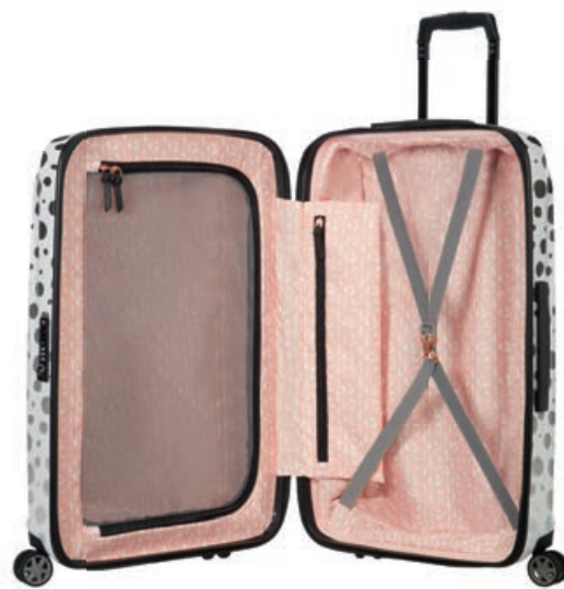
106438 (34C*008): SPINNER 69 DISNEY: 45 X 69 X 30 - 67.0 L - 3.5 KG