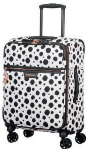
106436 (34C*006): SPINNER 55 SOFT DISNEY: 40 X 55 X 23,5 - 36.7 L - 2.7 KG