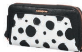
106441 (34C*011): WALLET DISNEY: 18,5 X 10,5 X 2,0 - 0.2 KG