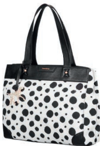
86962 (34C*001): HOR. SHOULDER BAG DISNEY: 48 X 30 X 17,5 - 17.0 L - 0.6 KG