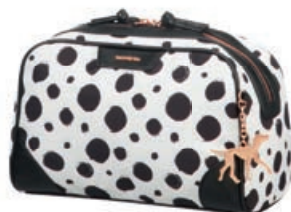
86966 (34C*005): TOILET KIT DISNEY: 28 X 18,5 X 12,5 - 6.0 L - 0.3 KG