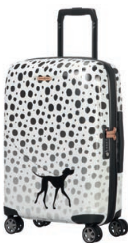
106437 (34C*007): SPINNER 55 DISNEY: 40 X 55 X 20 - 31.0 L - 2.5 KG