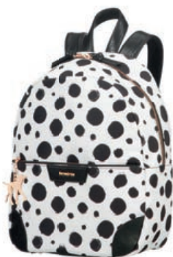
86964 (34C*003): BACKPACK DISNEY: 24 X 31,5 X 14,5 - 11.0 L - 0.4 KG