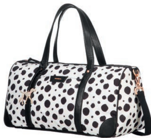
86965 (34C*004): DUFFLE DISNEY: 52,5 X 25,5 X 24,5 - 32.0 L - 0.8 KG