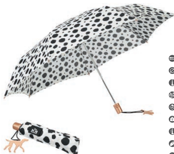
106439 (34C*009): UMBRELLA DISNEY