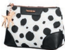
106440 (34C*010): TOILET POUCH DISNEY: 18,5 X 13 X 8 - 1.3 L - 0.1 KG