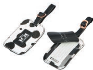
106442 (34C*012): LUGGAGE TAG DISNEY