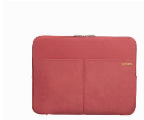
115283 (CM4*004): LAPTOP SLEEVE 15.6": 40 X 30 X 2 - 7.0 L - 0.3 KG ** 37,5 x 25,9 x 2,8 39,6 cm/15.6"