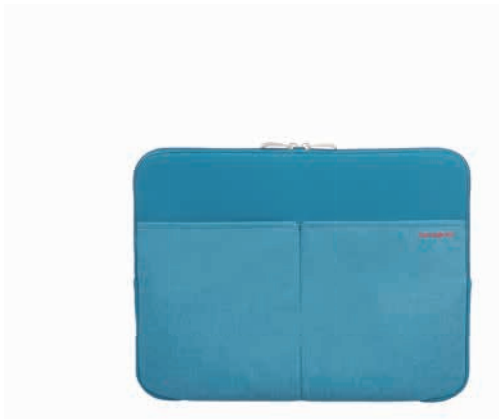
115282 (CM4*003): LAPTOP SLEEVE 14.1": 37 X 28 X 2 - 5.5 L - 0.3 KG ** 34 x 24 x 2,4 35,6 cm/14"