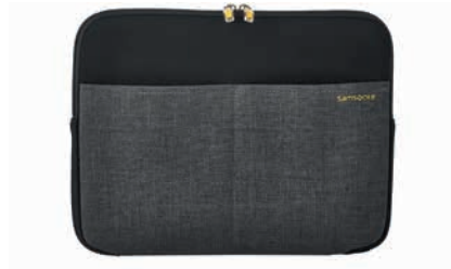
115280 (CM4*002): LAPTOP SLEEVE 13.3": 35 X 26 X 2 - 4.0 L - 0.3 KG ** 32,5 x 22,9 x 2 33,8 cm/13.3"