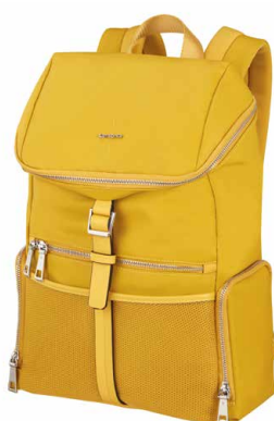
134680 (KF3*001) Top Open Backpack 14.1"