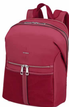
135582 (KF3*002) Zippered Backpack 15.6"