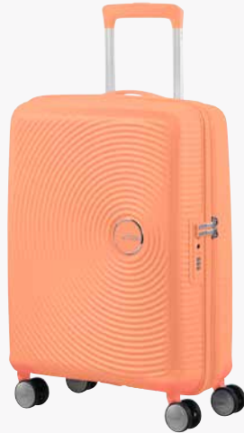
SPINNER 55 EXP 88472 (32G*001)