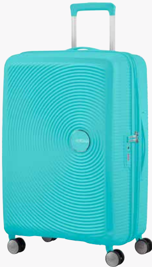
SPINNER 67 EXP 88473 (32G*002)

46,5 x 67 x 29/32 cm | 71.5/81 L - 3.7 KG