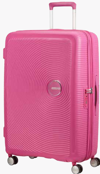
SPINNER 77 EXP 88474 (32G*003)

51,5 x 77 x 29,5/32,5 cm | 97/110 L - 4.2 KG