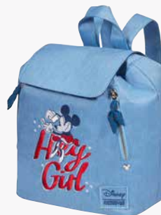
CITY BACKPACK DISNEY* 131929 (53C*004) 23,5 x 27,5 x 16 cm | 7.0 L - 0.3 KG