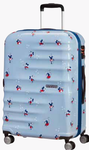
SPINNER 67 DISNEY 85670 (31C*004) 47 x 67 x 26 cm | 64.0 L - 3.6 KG