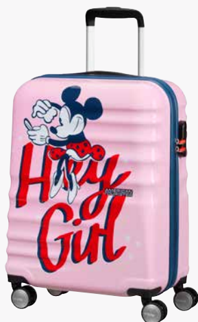
SPINNER 55 DISNEY 85667 (31C*001) 40 x 55 x 20 cm | 36.0 L - 2.6 KG