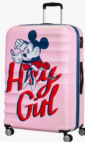
SPINNER 77 DISNEY 85673 (31C*007) 52 x 77 x 29 cm | 96.0 L - 4.2 KG

* Only available in 8695 (*01) Minnie Darling Blue